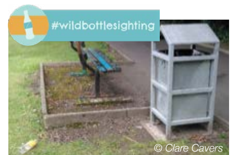
Spot the wild bottle next to the bin!

We're one step closer to a Deposit Return Scheme (DRS) in Scotland. Roseanna Cunningham has commissioned Zero Waste Scotland to investigate the design of a potential system for Scotland. This is the crucial next step to make DRS a reality. Hopefully #wildbottlesighting will soon be a thing of the past.