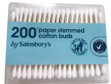
Sainsbury's new paper buds in redesigned packaging.